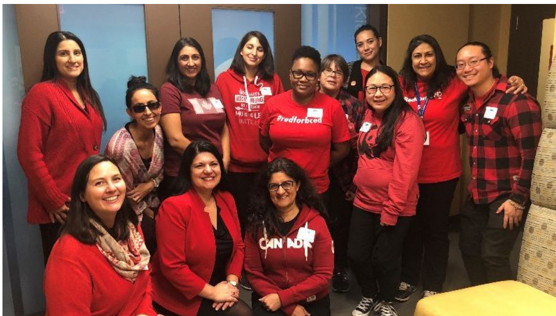
Pictured are Surrey teachers wearing their #RedforBCED at last week's staff rep training!

Surrey teachers, please send us photos and videos of your staff wearing their red, holding walk-ins, burma shaves, and any other acts of solidarity. Let us know if we can help support you in any way. We need a fair deal that includes better working and learning conditions, and fair salaries!