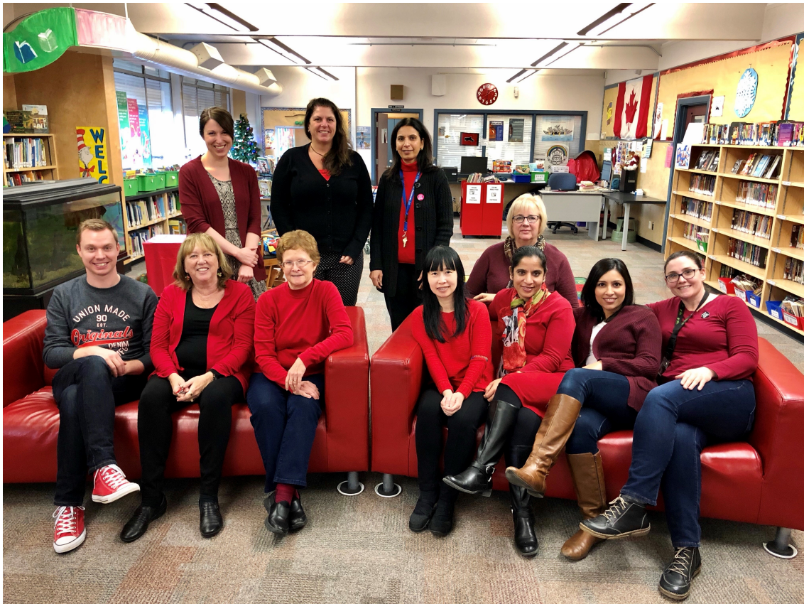
Pictured are staff at Senator Reid wearing their #RedforBCED on their red couches!

Surrey teachers, please send us photos and videos of your staff wearing their red, holding walk-ins, Burma Shaves, and any other acts of solidarity. Let us know if we can help support you in any way. We need a fair deal that includes better working and learning conditions, and fair salaries!