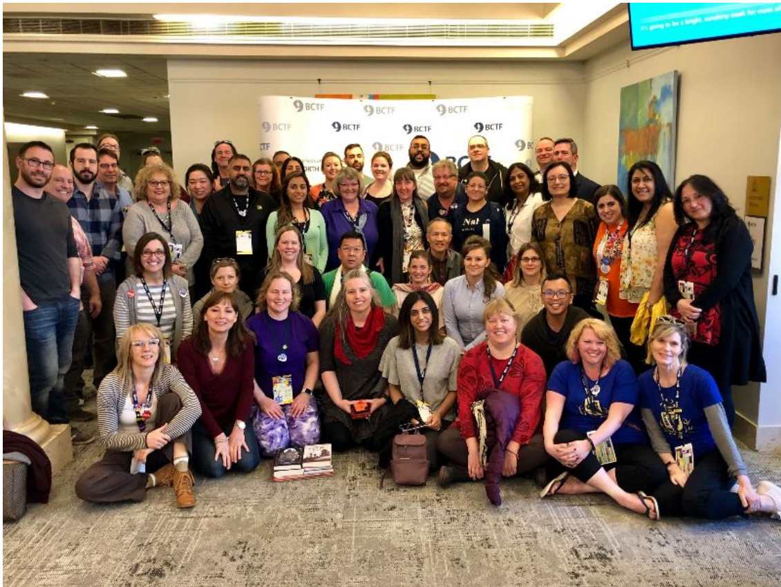
STA delegates to 2019 BCTF AGM

The BCTF Annual General Meeting will take place from March 14-17, 2020 at the Hyatt Regency Hotel, Vancouver.