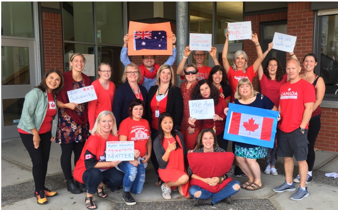
White Rock Elementary Staff

It's the time of year when EVERYONE is donning their red sweaters and hats, making it super easy to find something red to wear on Wednesdays with your staff.