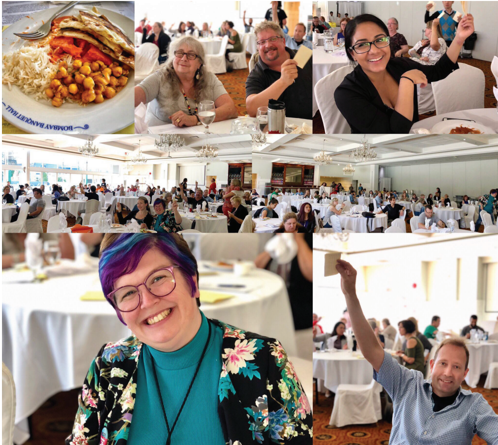
STA members voting and enjoying dinner at the Special General Meeting.